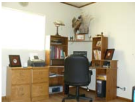
The new office—TLK Training Center