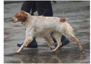
TR CH TopperLyn D'Artagnan CBV Jubiläumszuchtschau Bomte, Germany