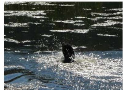
TopperLyn Hera Definitely her father’s daughter in the water.

I first saw Hera’s ability in the water demonstrated when she was about five months old. I had thrown a dummy to the far side of the pond for D’Art but before either of us realized what happened—Hera was well on her way to it. D’Art had to put it in over-drive in order to not let his puppy beat him to the